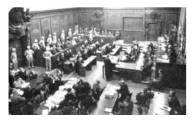
Nuremberg War Tribunal 1946/47 : 24 managers of Hoechst, Bayer and BASF were indicted for mass murder, slavery and other crimes against humanity.

From knowing this, we understand the support from Bonn for the unethical plans of the Codex Commission. ( Remark made by the Dr. Rath Health Foundation )