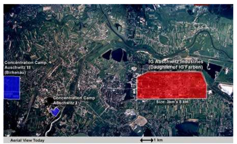
The map of Auschwitz (above) speaks for itself. The size of the IG Auschwitz plant (red area) was larger than all Auschwitz concentration camps (blue area) taken together.

chemical gas Zyklon-B used for the annihilation of millions of people was derived from the drawing boards and factories of IG Farben.