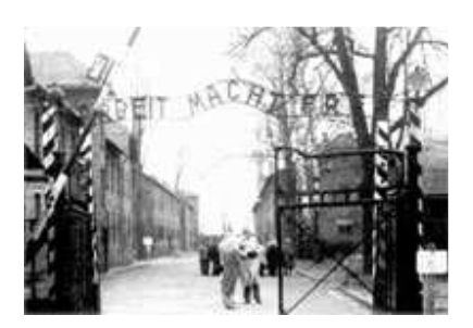
The entrance of the Auschwitz Concentration Camp

He was a member of the Managing Board of IG Farben from its inception to its dissolution. As the Wartime Manager, he was responsible for IG Auschwitz.