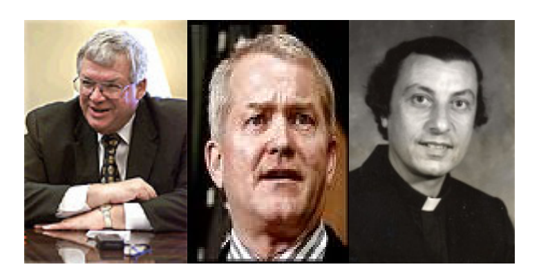
The Speaker, The Rep. & The Priest

since the armed robberies began in 1982, police last month released identikit photos of possible suspects.