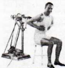
Illustrating the World Famous Athletic Model Health Builder

Only 15 minutes a day of delightfully soothing vibratory exercise and massage—the unique method devised in Battle Creek, world's health