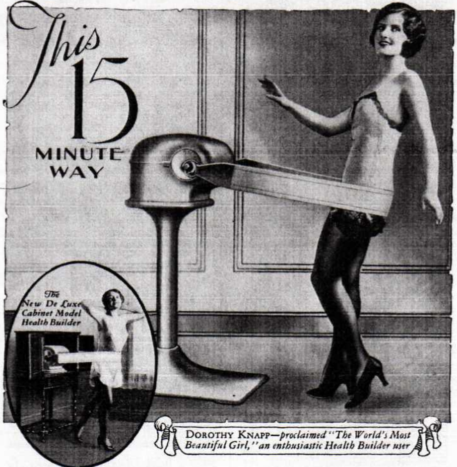
DOROTHY KNAPP—proclaimed "The World's Most Beautiful Girl," an enthusiastic Health Builder user

NOW , more than ever before, the modern woman is intolerant of overweight. Not only because of fashion's decree, but more important, for radiant health and vigor, a figure of youthful slenderness is much to be desired.