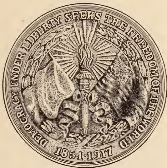
GOLD MEDAL PRESENTED BY THE CITY OF BOSTON TO VISCOUNT ISHII